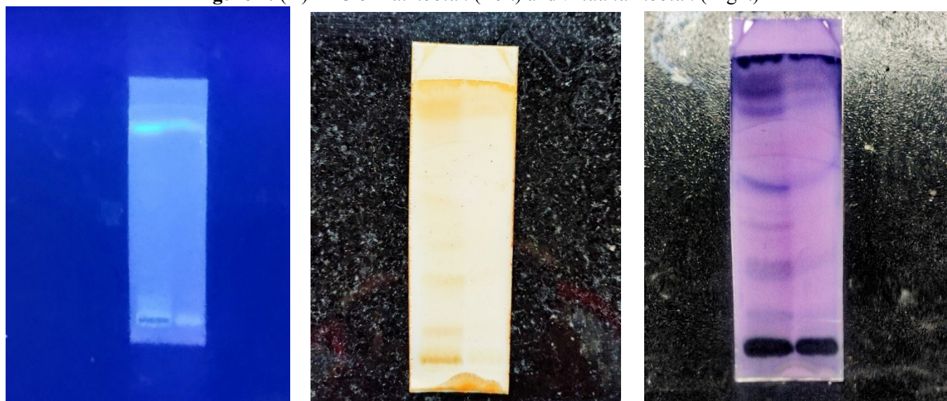
TLC under UV 366 (B) TLC after iodine treatment (C) TLC under Vaniline derivatization Detection - Under Vaniline + conc. HCl