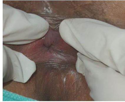
28 th day