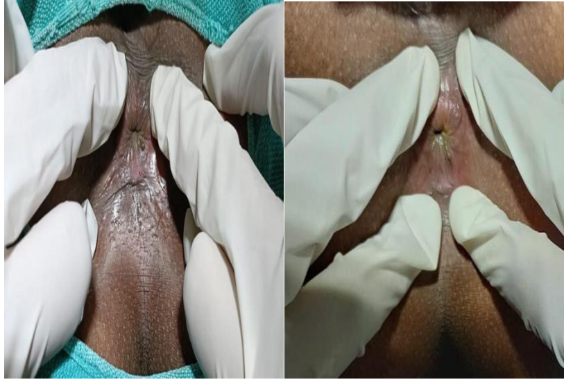
14 th day