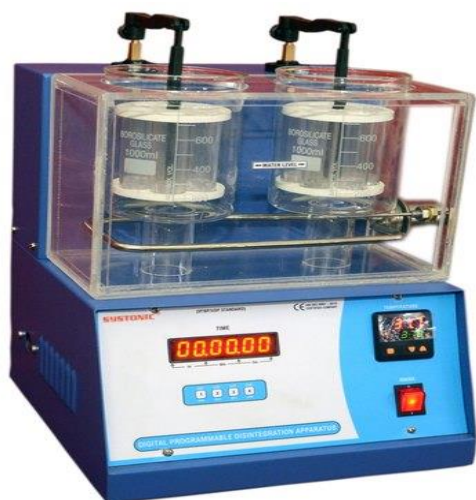
FIGURE 1: DISINTEGRATION TEST APPARATUS