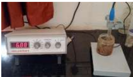
pH of the gel