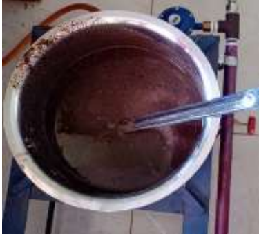
Must have Kwatha