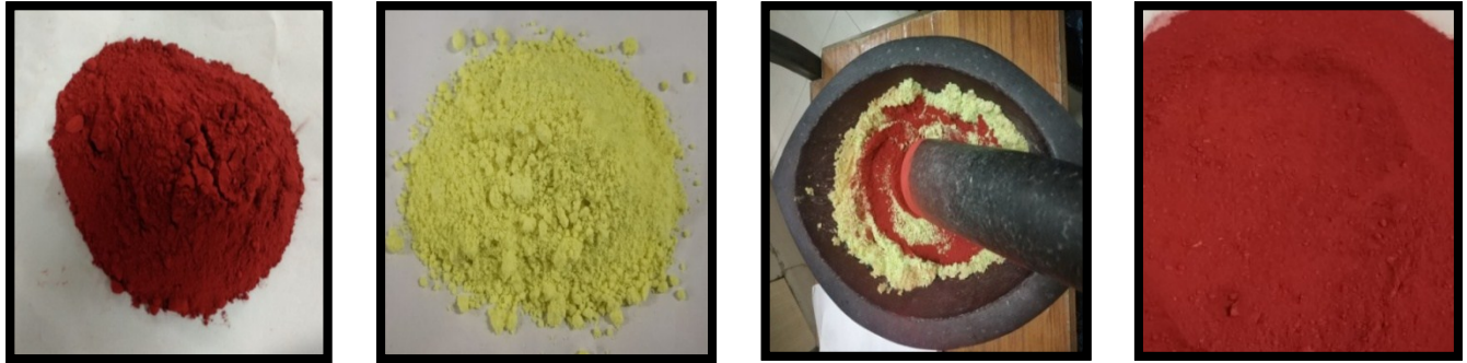
Fig. No.1: Showing the process of Slakshna Churna preparation