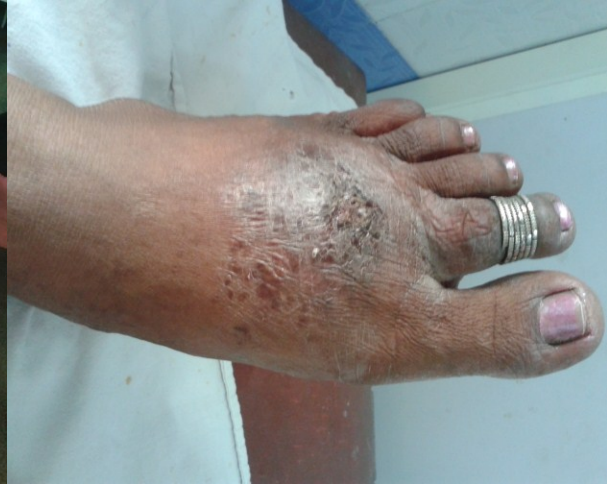
Fig. 2 After Treatment