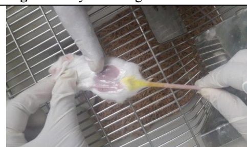
Fig 5. Apply Betasallic Drug