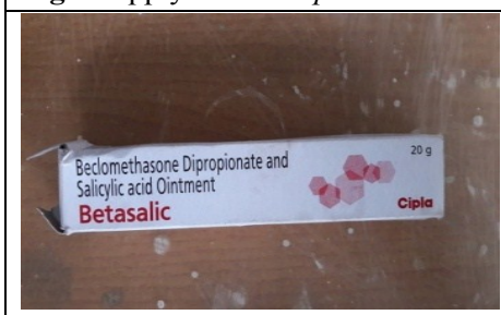
Fig 7. Betasallic Ointment