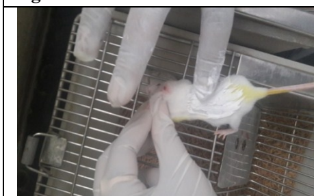
Fig 4. Apply Mukta Lepa