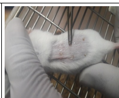
Fig 3. Removal of Sting