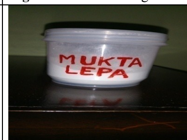
Fig 6. MuktaLepa