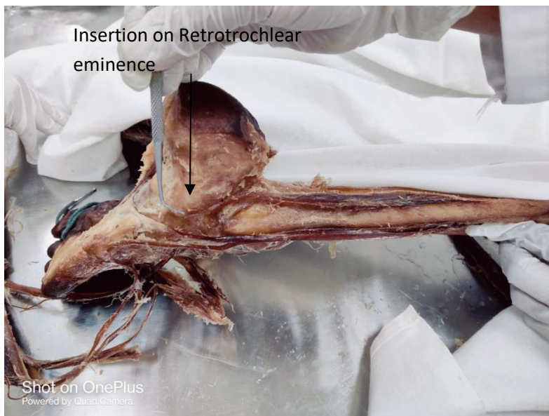
Fig.no 02 Shows the insertion of assessor fibres of peroneus quartus muscle at retrotrochlear eminence on lateral aspect of calcaneus.