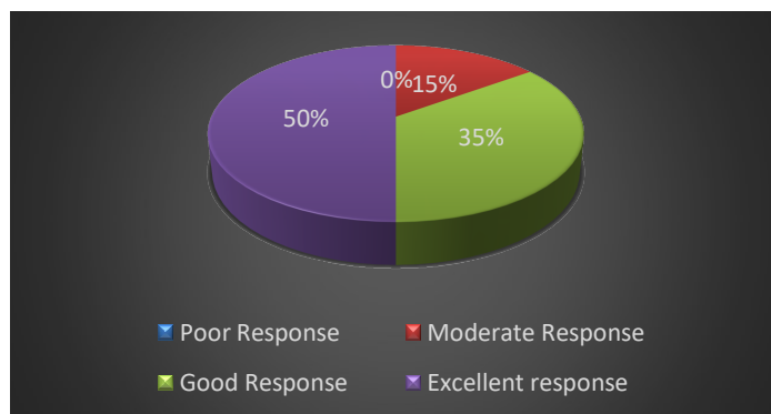
Overall effect of treatment