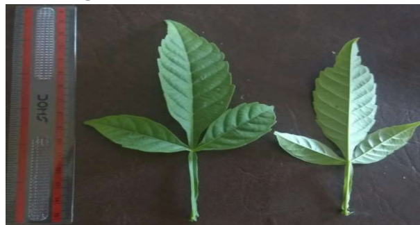
Fig no 1: Leaf of Vitex altissima L.f