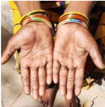
Figure 4 DAY 21