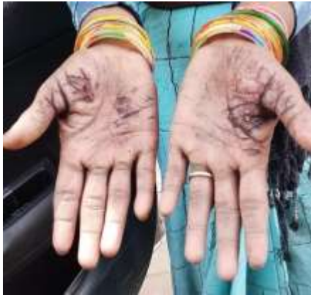
Figure 1 DAY 1

tively treated with the help of Shodhana and Shamana Chikitsa at the OPD level. From the above case study, it can be evaluated that the cracking condition of the palm and sole can be successfully treated by following only the ayurvedic line of treatment.