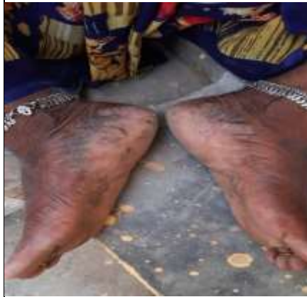
Figure 5 DAY 8 FEET