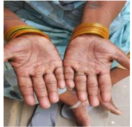
Figure 3 DAY 15