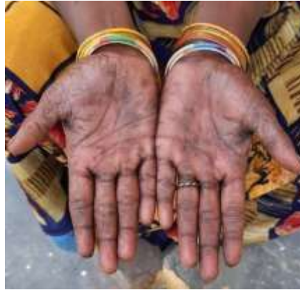
Figure 2 DAY 8