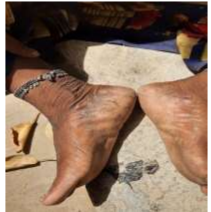
Figure 5 DAY 15 FEET