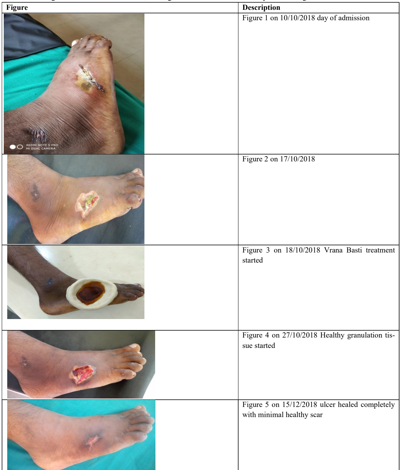
Table 2: Image of ulcer before treatment, during Vrana Basti and after complete healing