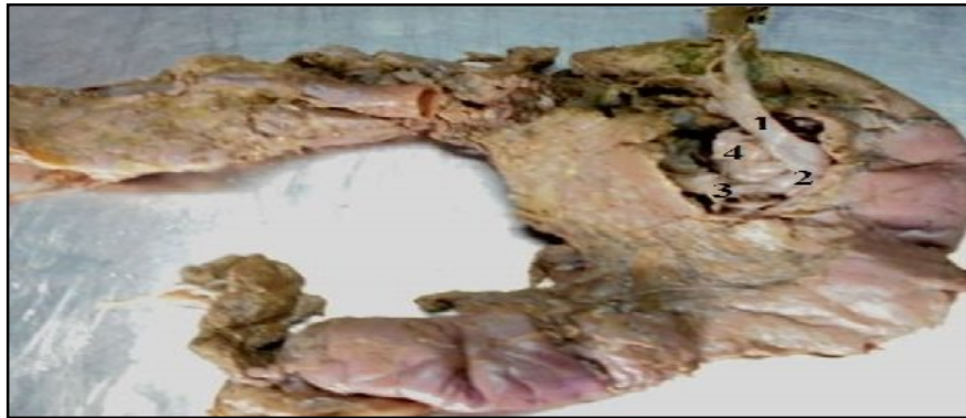
Figure 2: [5] Anterior Diverticulum