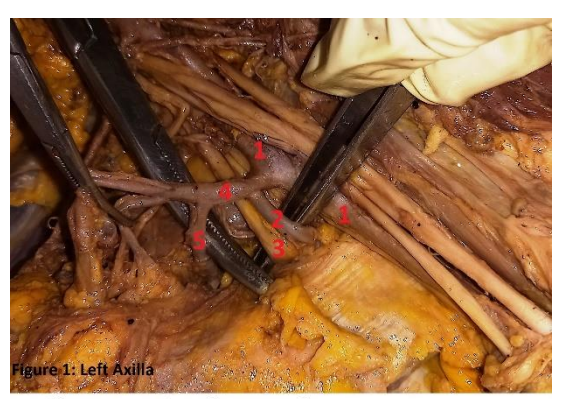
Axillary A 2.Post Circumflex Humeral A Axillary N 4. Subscapular A 5. Circumflex Scapular A