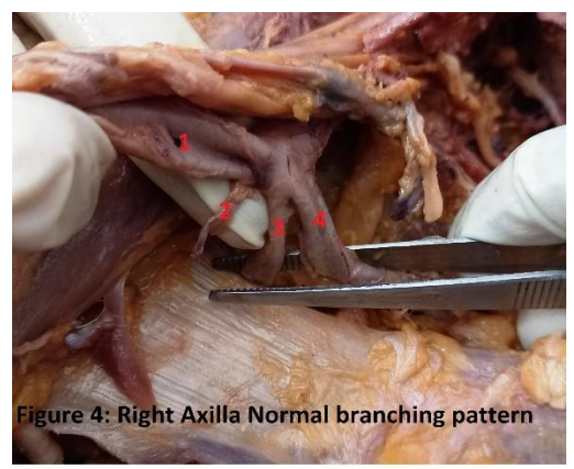
1. Axillary A 2. Ant Circumflex Humeral A 3. Post Cirumflex Humeral A 4. Subscapular A