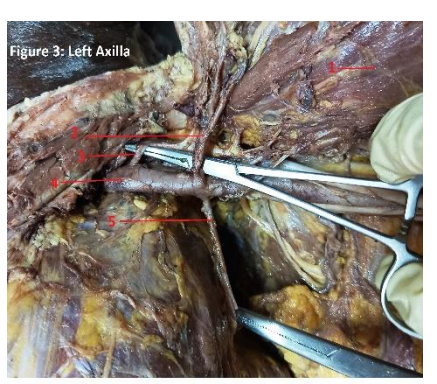
1. Pectoralis Minor 2. Acromiothoracic A 3. Anterior circumflet Humeral A 4. Axillary A 5. Lateral Thoracic A