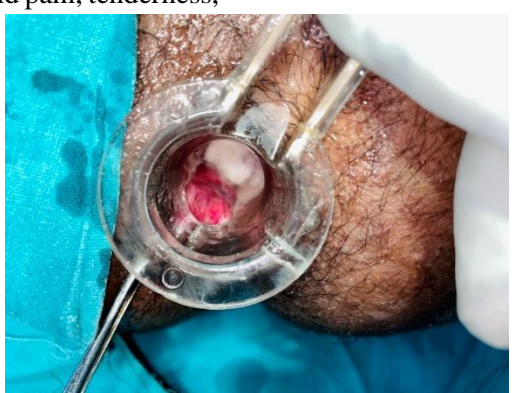
After treatment (Fig.5)

inflammation, and brownish black discharge on the first visit and second visit. During the third and fourth visit, there was no pain, tenderness or discharge and the internal hemorrhoids had completely resolved. [Fig.5]