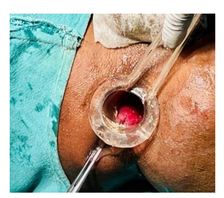
Before Treatment (Fig.1)