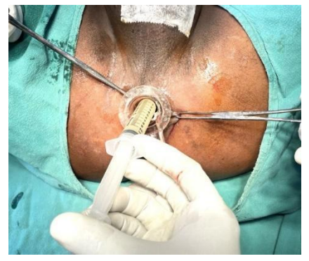
Washing with lemon juice (Fig. 3)