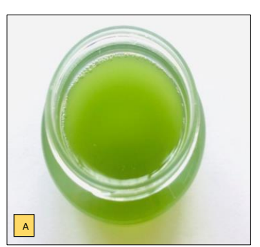
Figure No. 1: Evaluation of herbal shampoo A. Physical appearance of herbal shampoo, B. Foaming ability, C. Dirt dispersion test, D. Foaming index, E. Skin irritation test, F. Solid determination test

completely natural raw material is a difficult task11. It is challenging to prepare an herbal shampoo using a single natural material that would be milder and safer than the synthetic shampoo and at the same time, would compete favorably with its foaming, detergency and solid content. We, therefore, considered formulating an herbal shampoo using traditionally and commonly used plant material as the main ingredient. Synthetic surfactant Sodium Lauryl Sulphate in a minimal amount of 0.8gm in 100ml solution was added to the prepared shampoo and triethanolamine was added to maintain the minimal thickness of the shampoo. In the present formulated shampoo, though named herbal shampoo, there are few inevitable sources utilized to maintain the shelf life of the formulation. Further changes can be made in the formulation in order to avoid the chemical reagents for a better outcome.